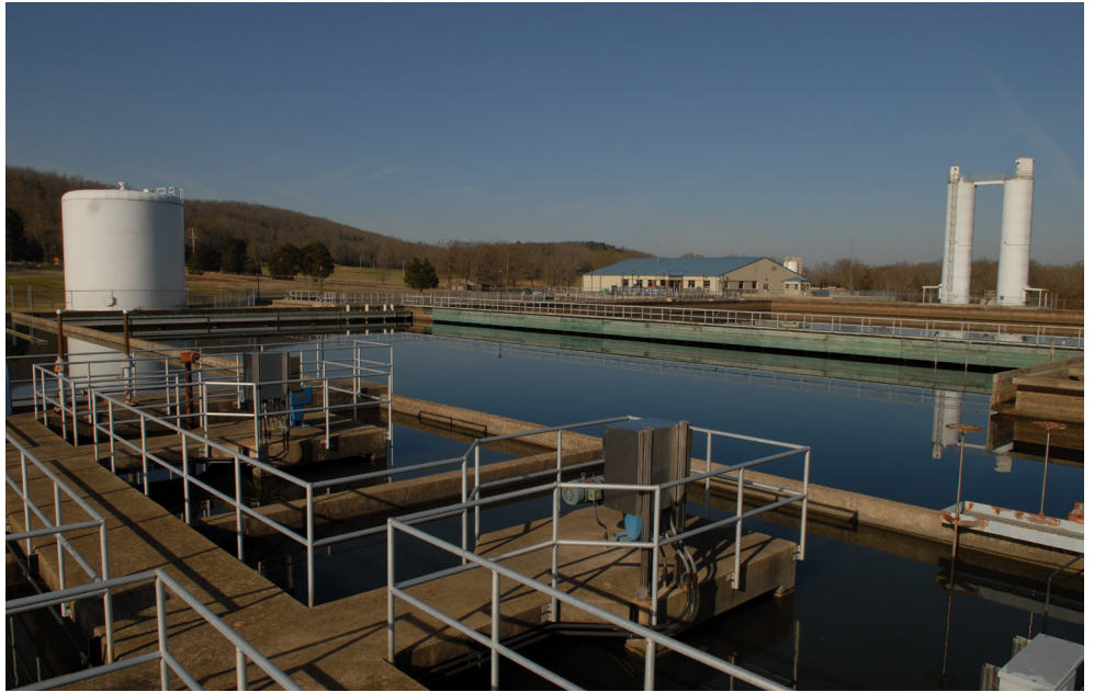
Roger Q Mills Water Treatment Plant

“New water supply projects take a very long time to be approved and built, as there is significant regulatory oversight to develop these projects,” Dell said. “Because it takes so long to obtain