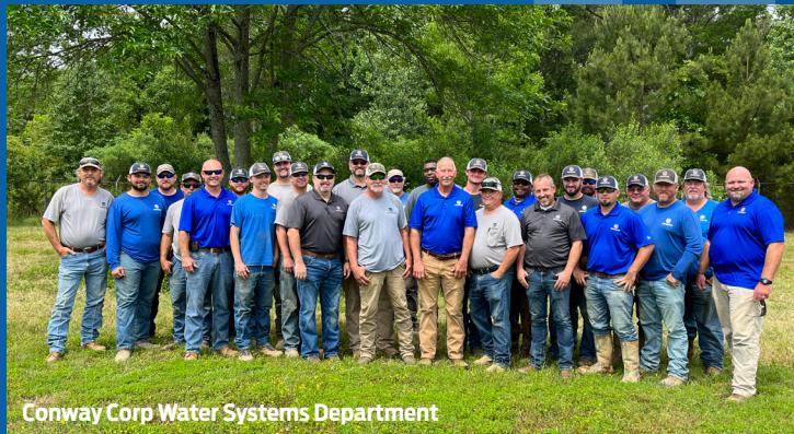
Conway Corp Water Systems Department

We are also working with the Mid Arkansas Water Alliance to acquire