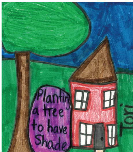
Woodrow Cummins Elementary third grader Tori Worley won first place in the 2015 poster contest with this entry.

All entries should be submitted to participating teachers or postmarked to Conway Corp, 1307 Prairie Street, Conway, AR 72034 by Friday, September 30. Essay entries can be shared via Google Docs or emailed to marketing@myconwaycorp.tv . Visit ConwayCorp.com/EnergySmartContest for details.