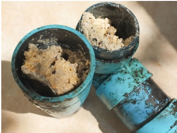
When fats, oils and grease are poured down the drain, sewer pipes can become clogged.