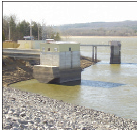
James H. Brewer Lake pictured during the 2006 drought.

Managers will be able to track the volume of water entering the reservoir during a year, season, month, or even during a specific storm, or during a drought. It is one of more than 150 streamgages