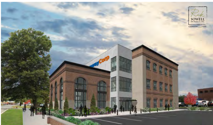
Conway Corp is set to begin construction on a new customer care center at its Prairie Street location.

The company expects to complete construction on the building in early 2017.