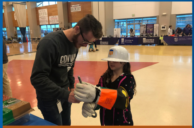
Employees from Conway Corp's Cable, Engineering, Marketing and Water Departments recently visited with students and parents at the Ruth Doyle Middle School STEM night. The event featured hands-on science, math and engineering activities for students and families to complete together.

This newsletter is published quarterly by Conway Corporation, operators of the cityowned electric, electronic and water systems. Conway Corp is a notfor-profit organization dedicated to exceeding our customers' expectations in producing and delivering safe, affordable, reliable, innovative and environmentally sound utility and telecommunications service while enhancing the quality of life in our community. Customer comments are welcome.